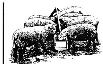
Lambs should be fed in feeders off of the ground, particularly in confinement dry-lots.

be successfully fed. This permits a reduction in feeding costs provided the silage facilities are being used by some other livestock enterprise. Feeder or weaner lambs are generally purchased in the West in the fall and sold throughout the winter and early spring months.